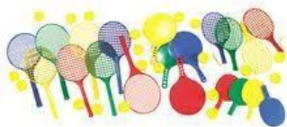
Bats and Balls Try a balloon if a ball too difficult