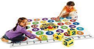
Board games and jigsaws completed on the floor