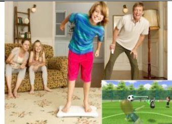
Nintendo Wii Xbox Kinect