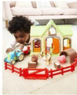
Position on floor when playing as it develops shoulder strength